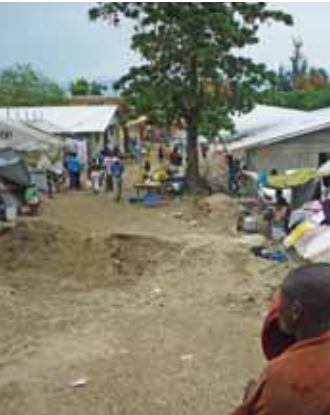
top right: Photo courtesy of Emmanuel NOEL top: Photo courtesy of Mlle Saran Koly, Communication Officer, UNDP right: Photo courtesy of Mlle Saran Koly, Communication Officer, UNDP