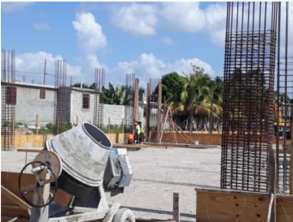
Les Cayes Works – Feb/2020