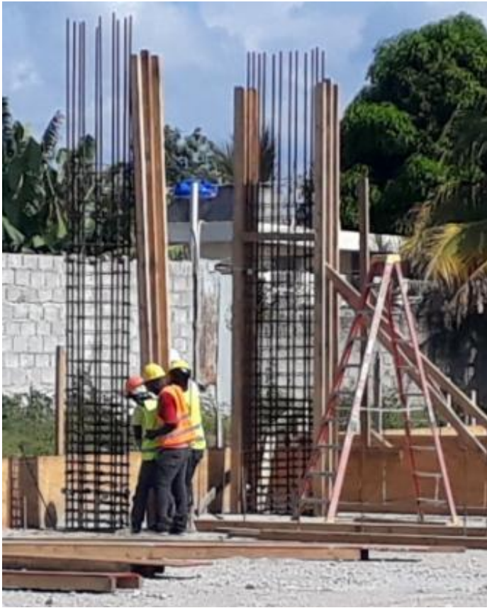
Les Cayes Works – Feb/2020