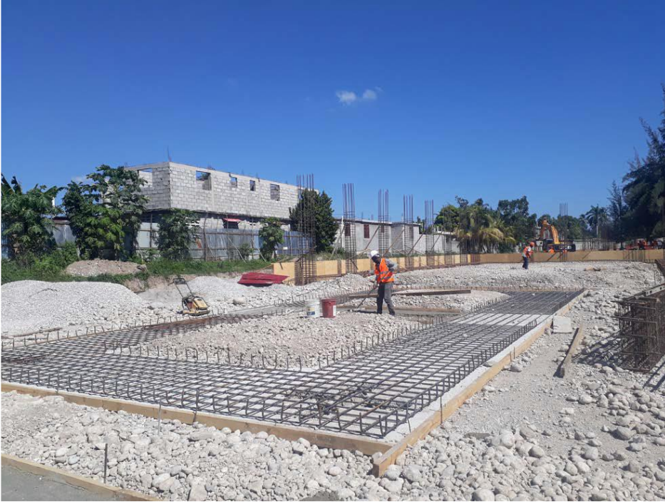
Finished reinforcement awaiting the pouring of concrete