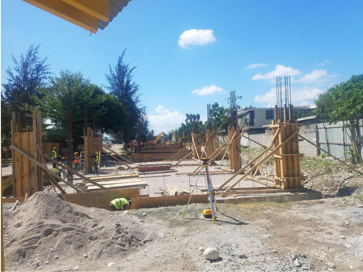
Les Cayes Works – Feb/2020