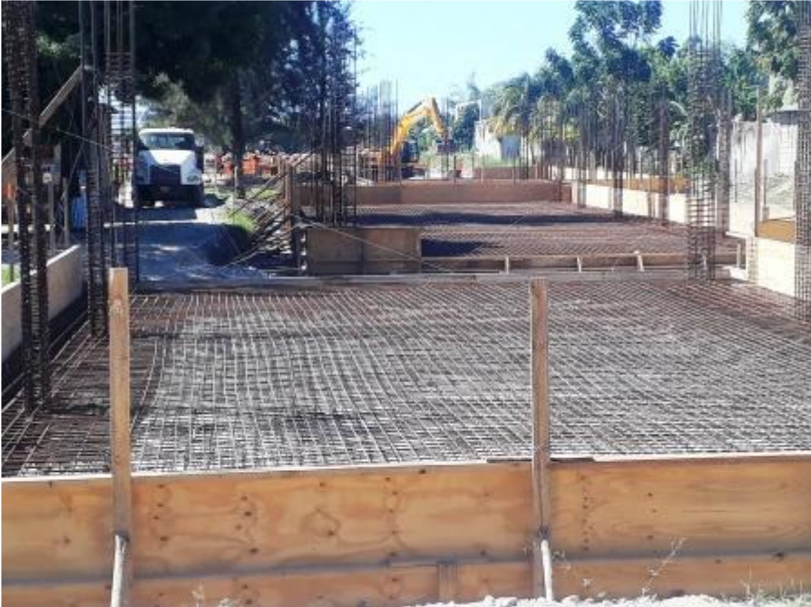
Finished reinforcement awaiting the pouring of concrete