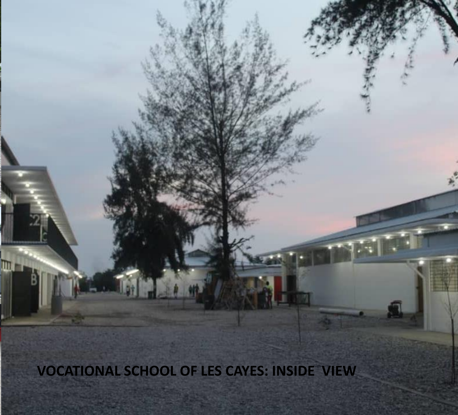
VOCATIONAL SCHOOL OF LES CAYES: INSIDE VIEW